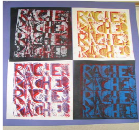
A piece of art created by Kennedy student, Rachel Orth hangs in the hallway closest to the art room.

Check out some of the amazing art work on display on the KMS website. Go to: http://www.kennedyirish.com/projects/art/album/index.html .