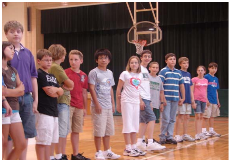
The members of the 2009-2010 quiz bowl team wait to be introduced in the Kennedy gym during the pep rally.