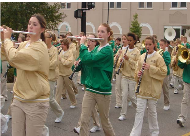
Kennedy-Felten band marches down Main Street in the State Fair Parade at Hutchinson, Kansas.

Everyone taking part in the trip was very excited. They couldn't wait until Wednesday, Sept. 16, to come around. Now, all members of band and dance tell their personal stories of this amazing trip.